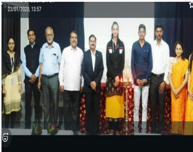
Inauguration of Workshop