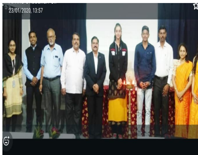
Inauguration of Workshop